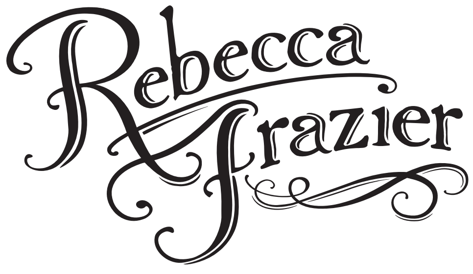
Tech Rider & Sound Requirements